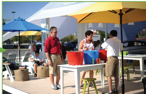
Get the Right Attendees – Blend email, direct & online leads within drive-time and geo targets