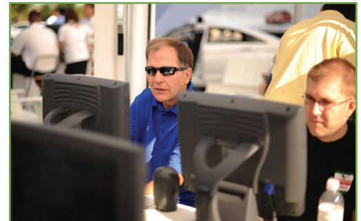
Collecting Data And Putting It to Work Within the Most Powerful Automotive List Strategy